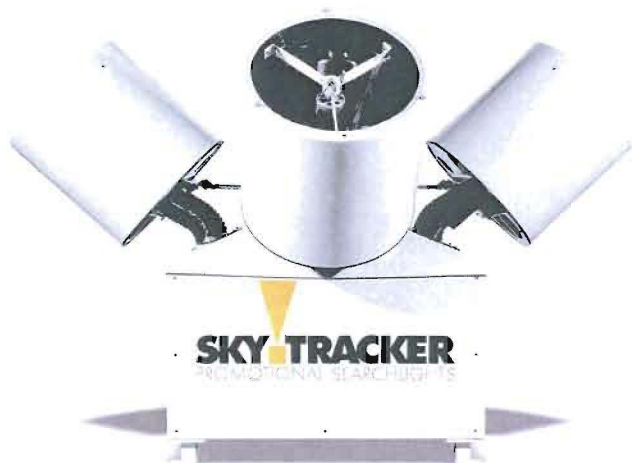
Models STX4-2000, STX4-4000